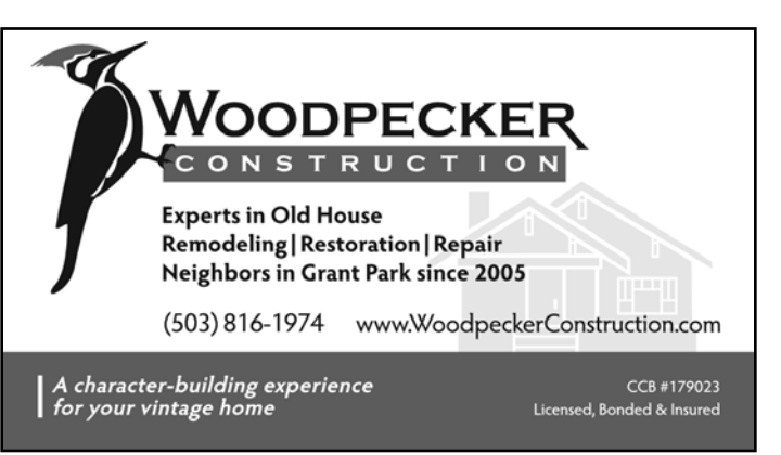
PO Box 13102, Portland, OR 97213

For more go to <u>oregoncivilwar150commission.com</u>, call 503-954-0308, or e-mail: <u>nwhistperspectives@gmail.com</u>.