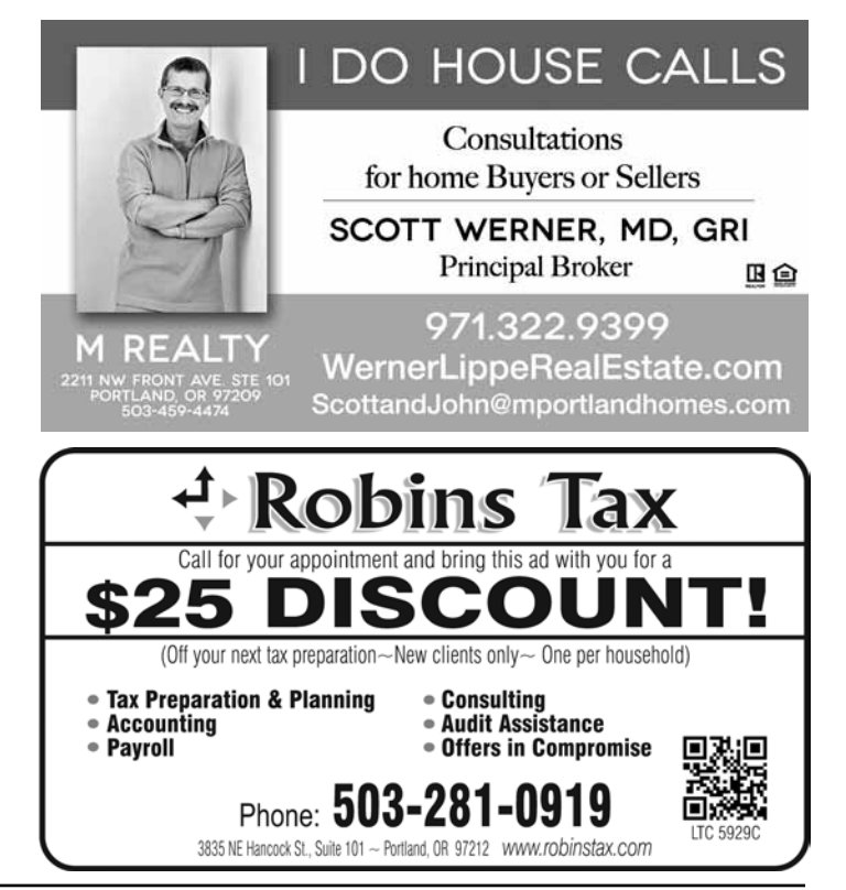
PO Box 13102, Portland, OR 97213

GPNA will be represented at the charrette, and seeks input from interested neighbors. Those who attended last year's meeting found it to be an enjoyable and efficient way to share ideas and gather information about the future of our primary commercial street.