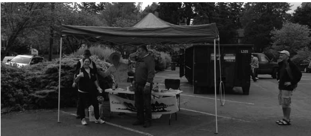
Our Greeters welcome cars and direct them (For more pictures check out our back page)